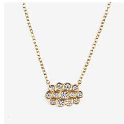
A. GE1502DIA / $5,995